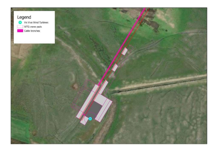
Figure 2-3 Typical WTG and Associated Working Platforms

Each wind turbine will have a permanent foundation with a hardstand of 855 m<sup>2</sup> (Figure 2-3). During construction, a 50 m<sup>2</sup> hardstand area for crane will be required at each wind turbine site. Total surface of the reinforced concrete foundations for the Project's 72 WTGs, will be 6.15 ha.